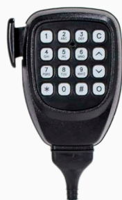
Optional MM300DK Keypad Microphone