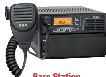
Base Station Conversion Kit BSC300D PKG