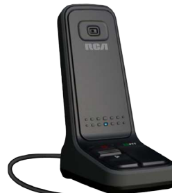
Desktop Microphone DMM1250