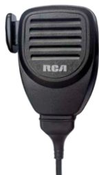
Speaker Microphone MM300D