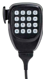
Keypad Speaker Microphone MM300DK